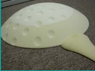
Golf ball with dimples!