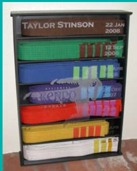
Custom Belt Racks available for any martial art!