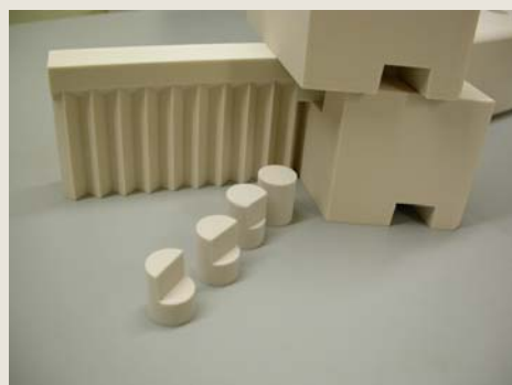
Machined HDU to be used as models for a concrete wall block system.